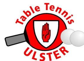
Table Tennis Ulster